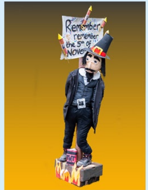
...And who could forget their winning Guy Fawkes, standing proudly to face the fire!