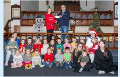
Friendly Faces everywhere!!!

Nevertheless, they are determined to all work on entering the Guy Fawkes competition again next year!