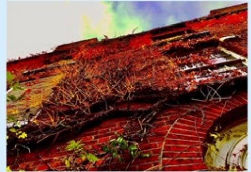
Second, Overall: Charlie had this unusual viewpoint