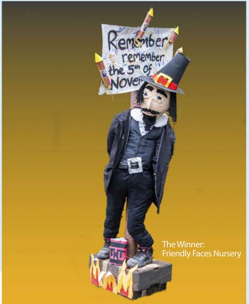
The Winner: Friendly Faces Nursery